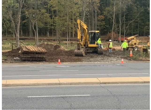
Grading & Placing Topsoil in Staging Area