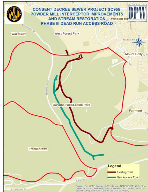
Figure 2: SC955 Phase III – Leakin Park