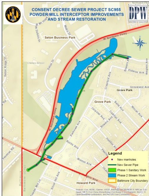
Figure 1: SC955 Phase I & II – Powder Mill Park