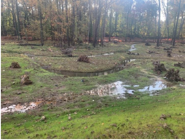
Stream Channel 3 after Storm

Below are some pictures to highlight work ongoing.