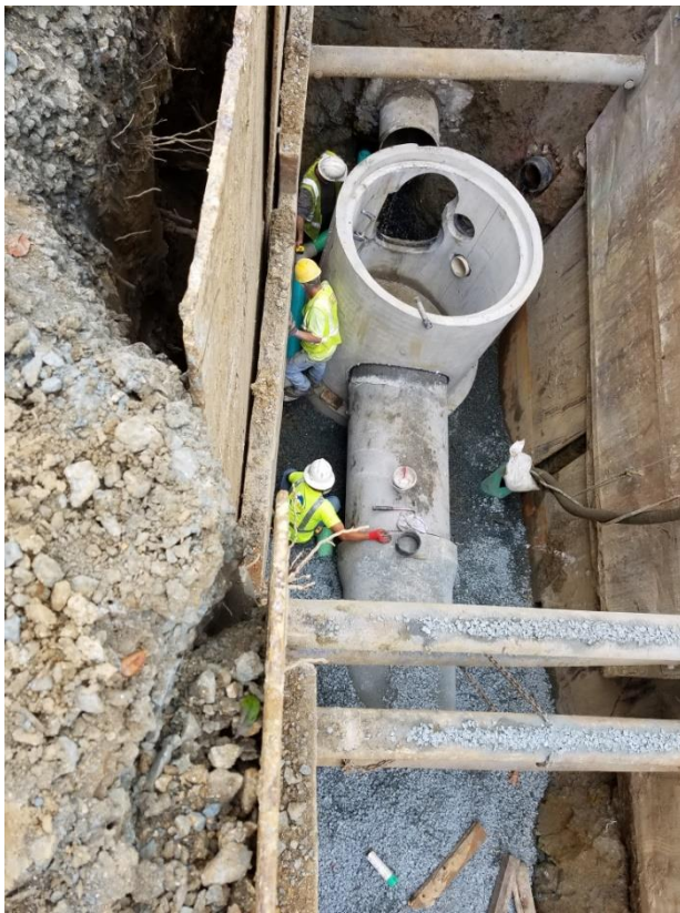
Installing Manhole S04KK1005MH